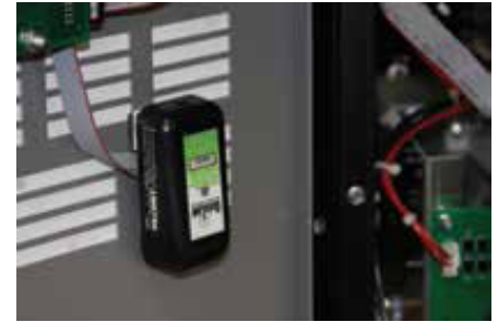
Detail View of CID

The Eclipse II Slimline HE is the most adaptive charging solution on the market, and it maintains the same quality you've come to expect from M-Pulse. The opportunity charging function will sustain the battery between 20% and 80% state of charge via short, opportunistic charges and is able to fully charge your battery in 6 hours or less. Conventional charging mode recharges any fully discharged lead-acid battery within the charger's rated capacity, flooded or sealed, in 8 hours or less.